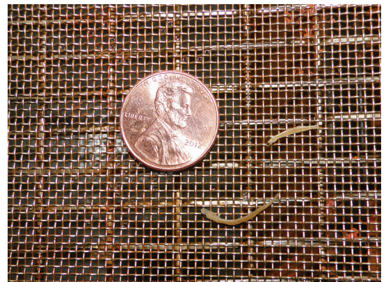
Larvae on the Fine Mesh Screen

On May 19, 2014 the United States Environmental Protection Agency (EPA) released the final rule to their Clean Water Act, Section 316(b). This rule affects existing power plants and manufacturing facilities that withdraw at least 25 percent of their water for cooling purposes from adjacent lakes, rivers, or oceans or that have a design intake flow of 2 million gallons of water or more each day. Section 316(b) requires the EPA to ensure that the location, design, construction and capacity of cooling water intake structures reflect the best technology available for minimizing adverse environmental impacts. The regulation is designed to protect fish, shellfish and other aquatic life from being killed or injured by cooling water intake structures.