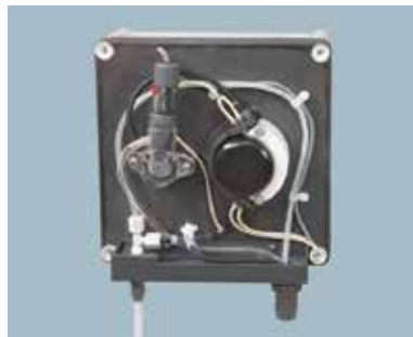
Sample Flow System