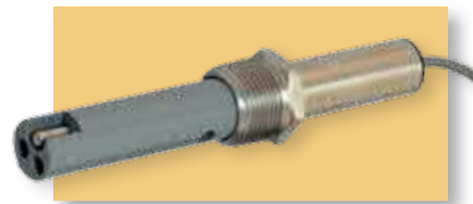
Conductivity Sensor CS52

Process connections are 3/4" NPT for insertion, and the back portion is 3/4" stainless steel tubing, which can be gripped by a swage fitting for submersion applications. A Teflon®* insulator is available as an option to the standard CPVC.